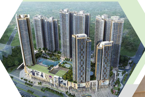
Paramount Project in Foshan

The highlighted project of SFK Properties for year 2018 - "The Paramount", was for sale starting from 1 January 2018. Ninety percent of apartments were sold quickly. In order to let Hong Kong citizens learn more about the project, Sun Fook Kong organized a Hong Kong Media Tour on 5 January 2018. Not only visiting apartments in The "Paramount", but also the shopping mall project "New DNA" which was going to be opened in April 2018.