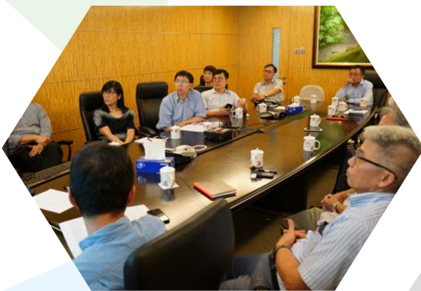
Briefing session of the E-leave System