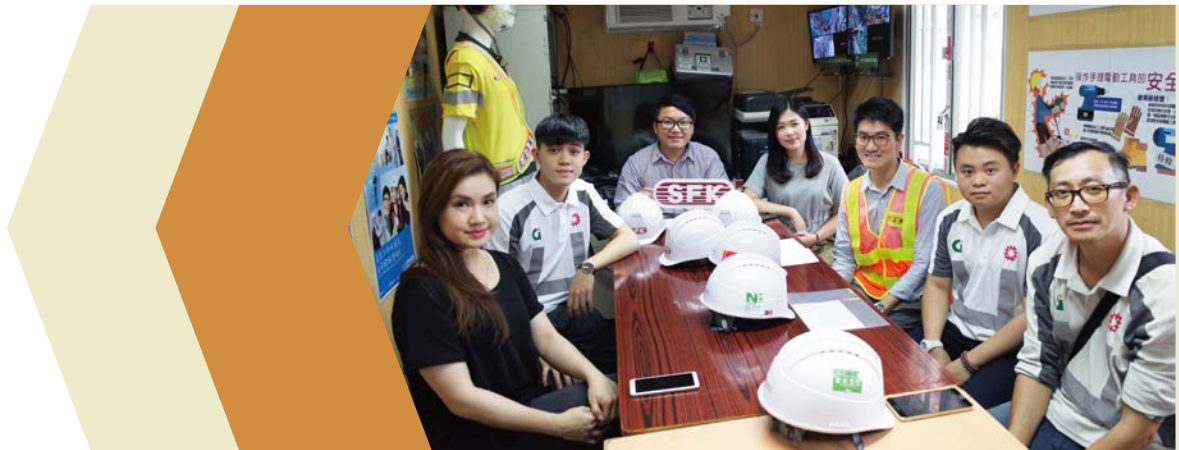
Internships who stayed in Diamond Hill's site shared their feelings and what they have learnt in the scheme