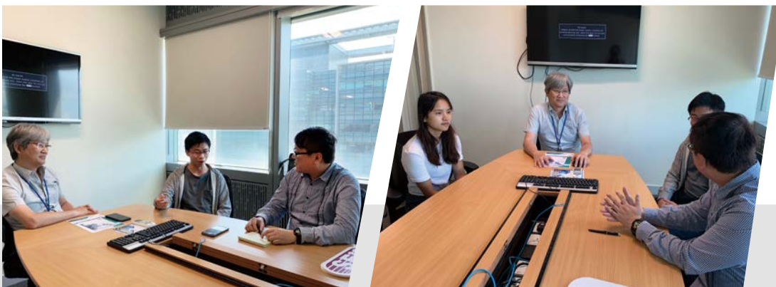
Internships who stayed in Build.IT shared their feelings and what they have learnt in the scheme