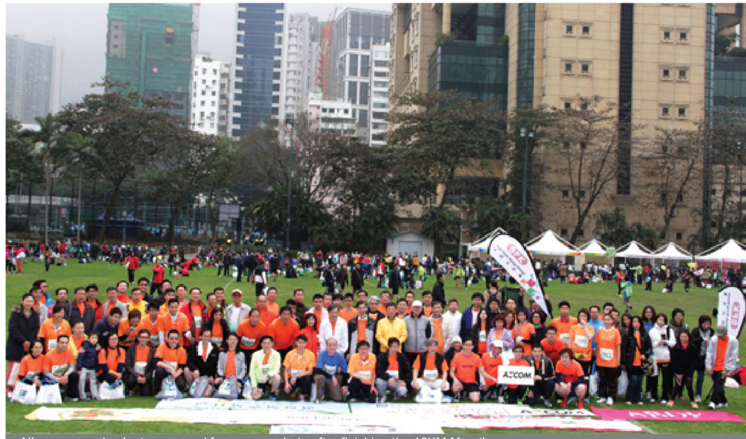
All runners and volunteers posed for a group photo after finishing the 10KM Marathon.

Sun Fook Kong has always paid a great effort in community services. We will continue to pay attention to staff's mental and physical health, as well as their development needs. At the same time, we would give a hand to those who are in need, keeping our core values as "Caring Staffs" and "Caring the Community".