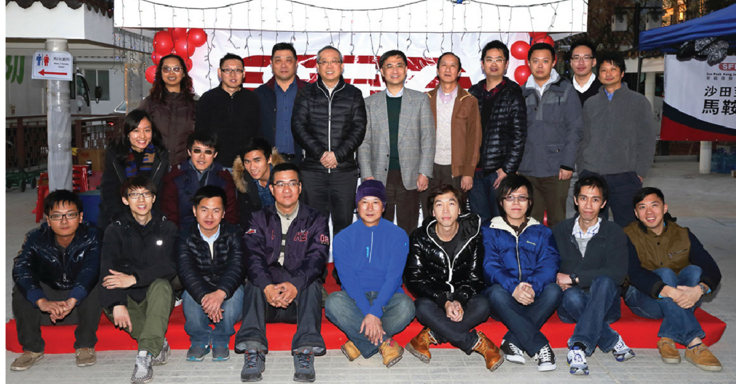
The project team of "MTR Shatin to Central Link Contract no. 1101 - Modification of Ma On Shan Line" posed for a group photo in the event.

The "MTR Shatin to Central Link Contract no. 1101 - Modification of Ma On Shan Line" of Sun Fook Kong Joint Venture has organized a "Poon Choi" Banquet at Shek Mun Playground on 20 February 2014. More than 200 staffs from Sun Fook Kong project management, project team and its business partners had participated in the event.