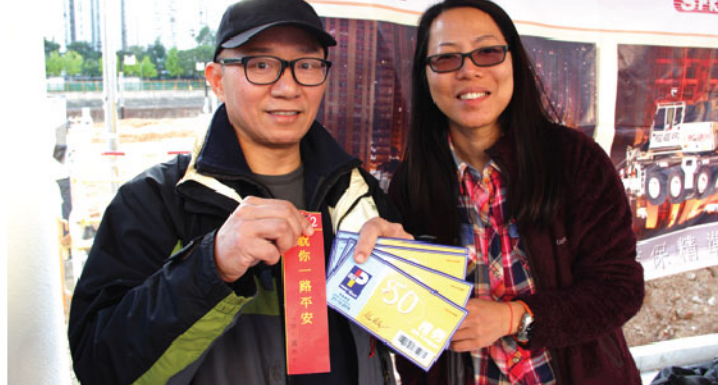
Gifts will be given to all winners of the "Safety Lantern Riddles" game.