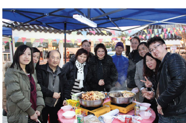
The participants shared the food together and a harmonious atmosphere had been created.