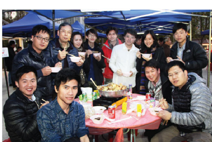
All participants enjoyed the "Poon Choi" activity and felt delighted.