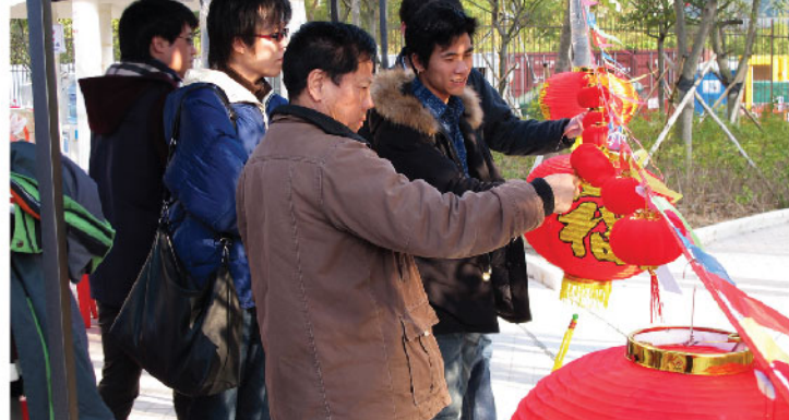
The staffs actively participated in the "Safety Lantern Riddles" game.

All comers had experienced a brilliant night with interesting game and delicious food. In order to improve the relationship and communication between its staffs and business partners, as well as building a harmonious working environment, Sun Fook Kong will continue to hold different kinds of activities and gatherings in future.