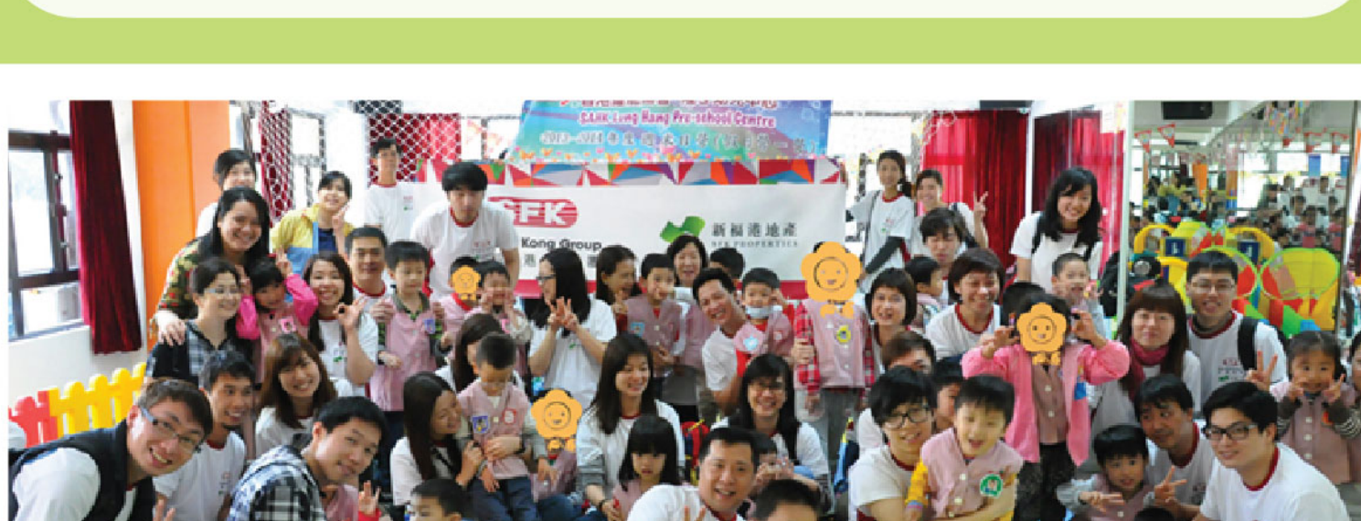
Both the Sun Fook Kong volunteers and the children have an enjoyable day.

Sun Fook Kong jointly organized an Easter Day Camp together with Lung Hang Pre-School Center of SAHK on 12 April 2014, with an aim to encourage the 2-6 years old autistic or physically disabled children to communicate more with others, so as to become participating members of the society.