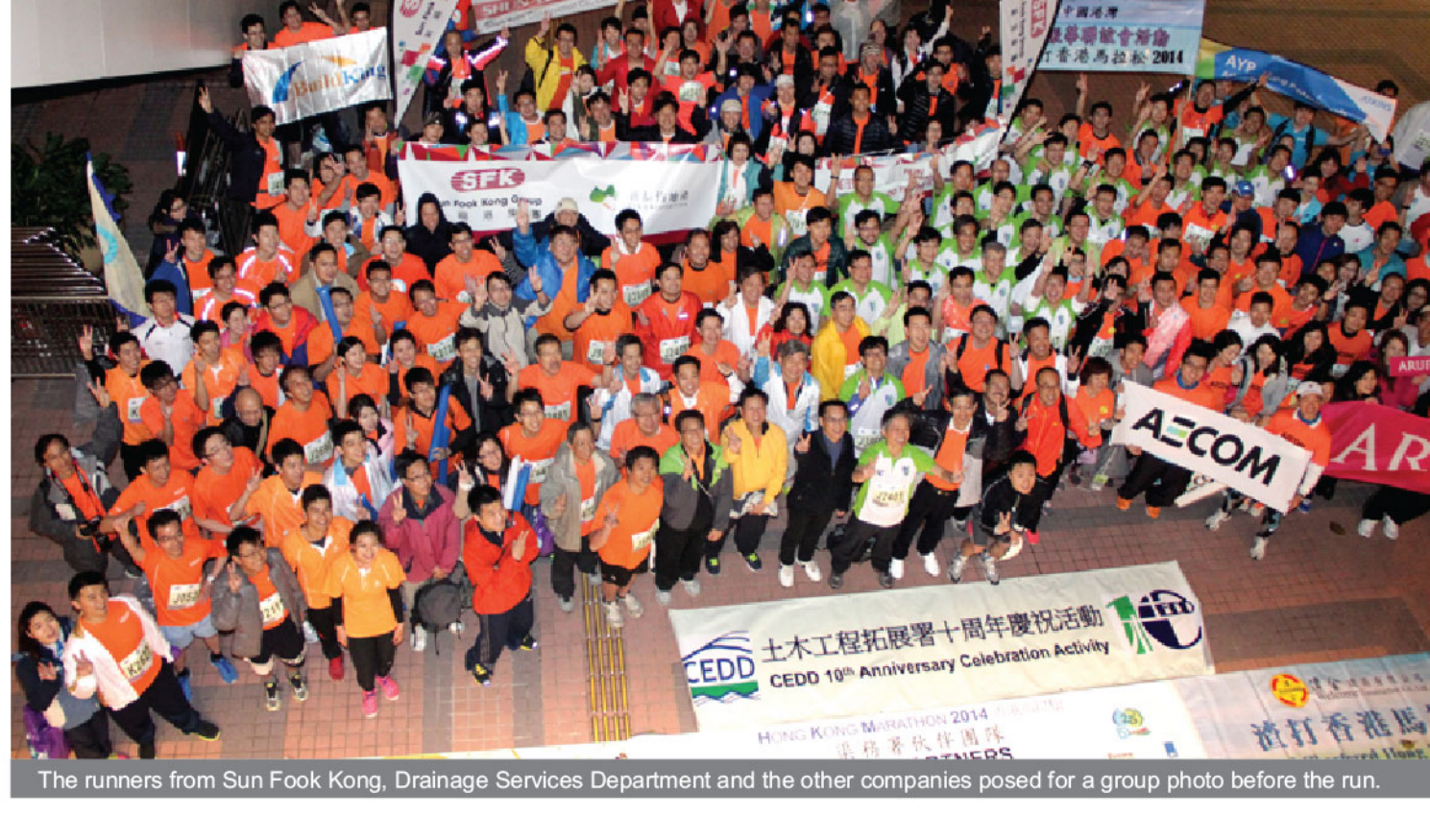
The runners from Sun Fook Kong, Drainage Services Department and the other companies posed for a group photo before the run.

Sun Fook Kong once again participated in the Standard Chartered Marathon together with the Drainage Services Department and the other business partners on 16 February 2014. Other than raising funds for the event organizer, the Group also aims to encourage its staffs to do more exercise. Apart from the 10 runners who had took part in the 10KM event, there were also about 20 volunteers who came to cheer for the runners and give them support.