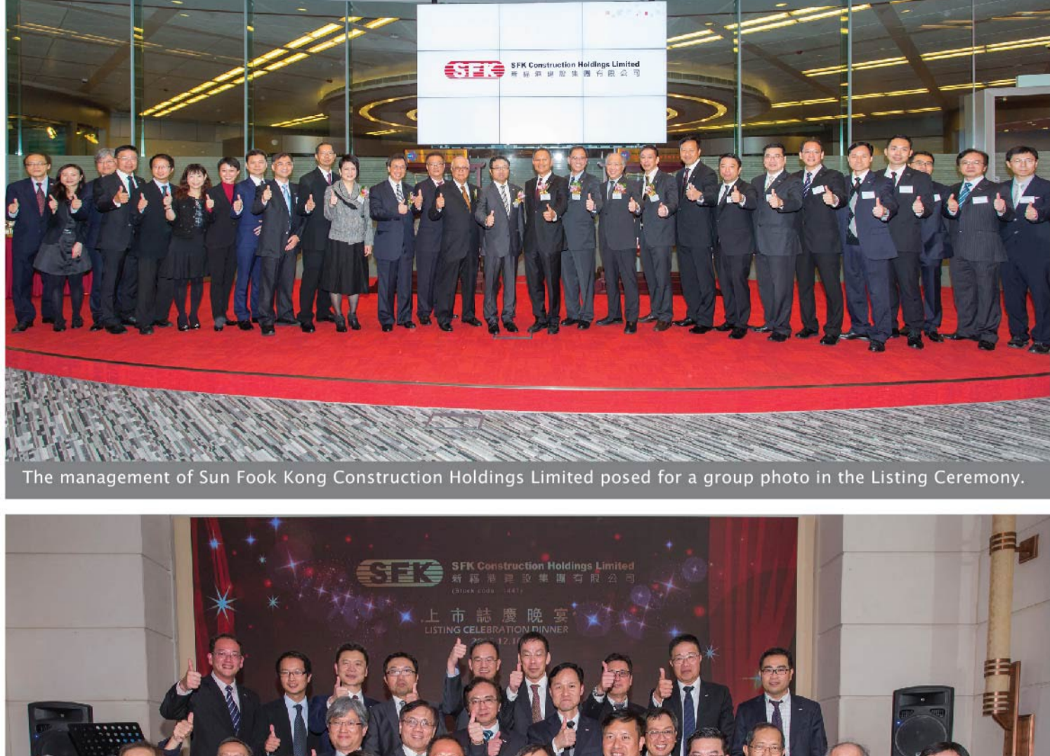
The management of Sun Fook Kong Construction Holdings Limited posed for a group photo in the Listing Ceremony.

Sun Fook Kong Construction Holdings Limited ("Sun Fook Kong") (stock code: 1447) was successfully listed on the Main Board of the Stock Exchange of Hong Kong on 10 December 2015.