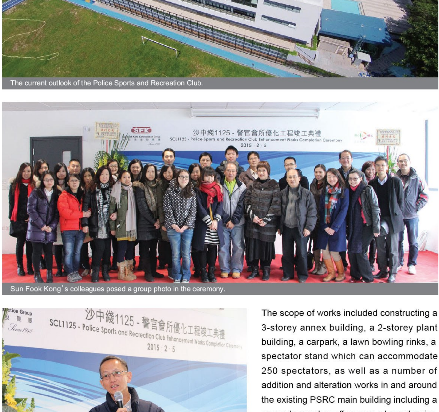
The current outlook of the Police Sports and Recreation Club.

Sun Fook Kong held a completion ceremony for Shafin to Central Link Contract No.1125 - Police Sports and Recreation Club Enhancement Works on 5 February 2015. The project was commenced in December 2013 with a contract sum of HK$297 million.